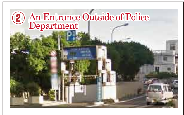
The entrance is also from Okinawa Prefectural building side.