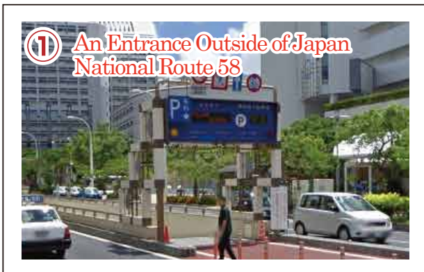
In the middle of the road, you can find the underground entrance between Okinawa Bank and Palette Kumoji building.

② An Entrance Outside of Police Department ! An entrance gate to the underground ※The details are as follows Fig.2